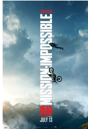
MISSION: IMPOSSIBLE - DEAD RECKONING PART ONE (CTC, 163 mins)