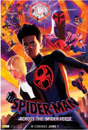
SPIDER-MAN: ACROSS THE SPIDER-VERSE (PG, Mild science fiction themes, animated violence and coarse language, 140 mins)