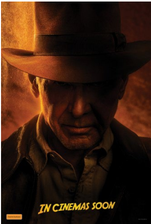
INDIANA JONES AND THE DIAL OF DESTINY (CTC, Sequences of violence and action, language, 154 mins)